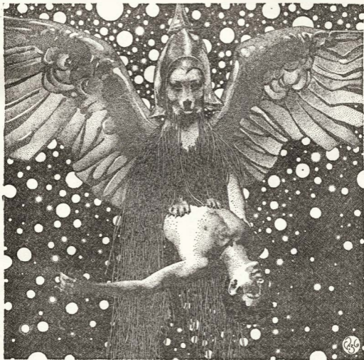
"My mind reeled out against the booming monody of the stars."