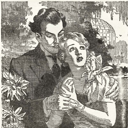
"The small voice whispered again, 'Danger! Danger!' and the orchid petals touched her cheek gently, pityingly."

ous I have ever seen. Was it this that had made me imagine things? If so, I'd better consult a psychiatrist immediately. Nice, well-brought-up girls of twenty shouldn't have such thoughts of their own volition. I'd never had them before, but I'd never seen anyone like Angus O'Malley, either. I noticed that his skin was very white, extraordinarily fine in texture for a man, and his hands were slender—the hands of an artist or a dreamer. I wondered who he was, and then remembered how I had felt looking