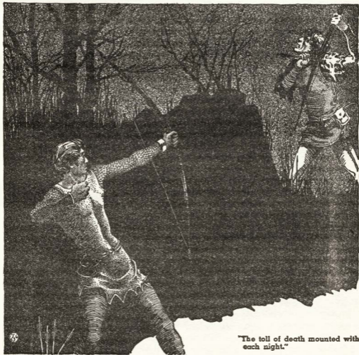
"The toll of death mounted with each night."

I HAVE just this moment received word from the captain. We are at last approaching our destination, for Farquhar has laid his maps on the chart table and