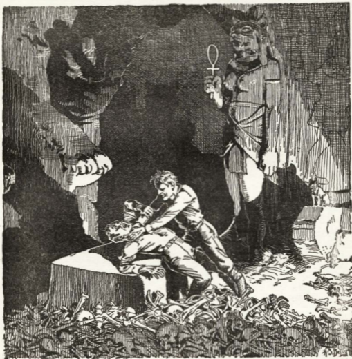
"His eyes were mad and his strength that of a fanatic."